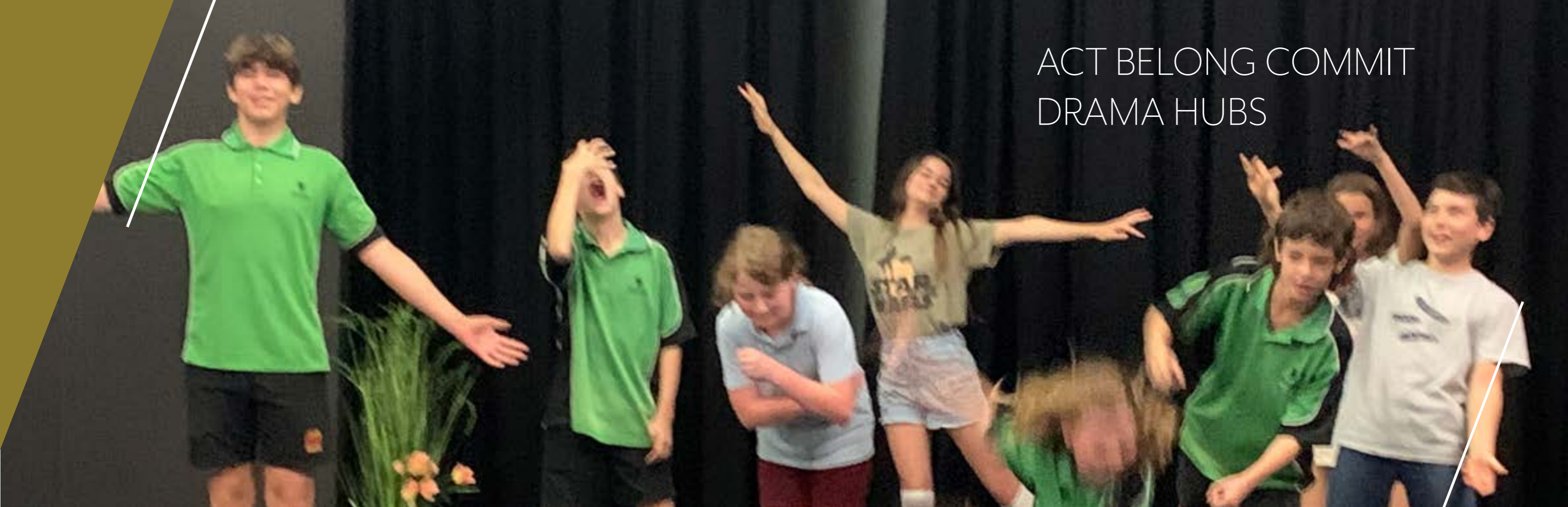
ABOVE: Students of Swan View Drama Hub, 2023 EOY Open Session.

A ct Belong Commit Drama Hubs continued to flourish across 2023. The longevity of presence of Drama Hubs in communities such as Bassendean and Swan View has enabled long-term impact amongst returning youth, some of whom have been attending for two years. Our teaching team and parents are observing positive and lasting shifts in confidence and sound acquisition of skills amongst participants.