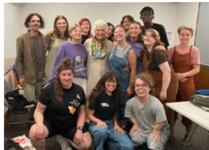
ABOVE: Seven Sisters Open Dress Run, 9 February 2023. Cast and crew meet new WAYTCO patron, Dr Fiona Stanley.